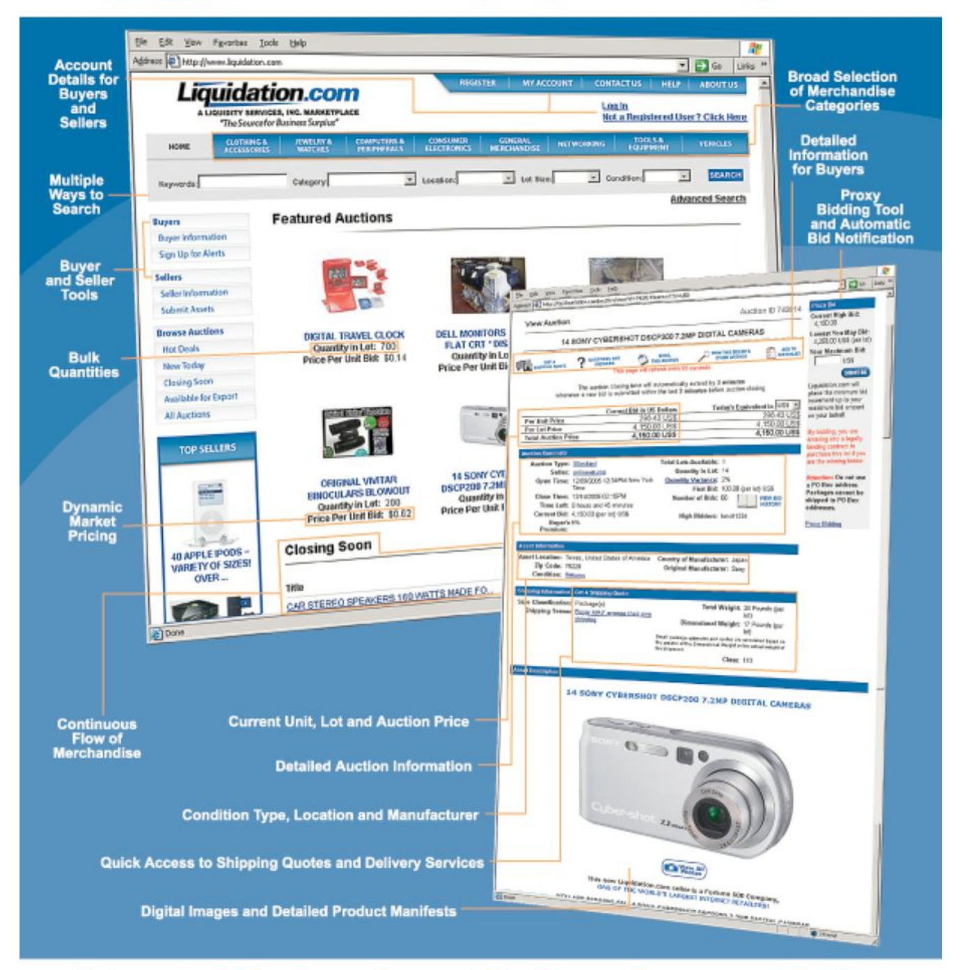
Integrated Services Support Business Buyers and Sellers in Over 500 Product Categories